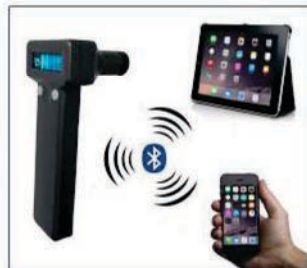
Bluetooth Data Transfer