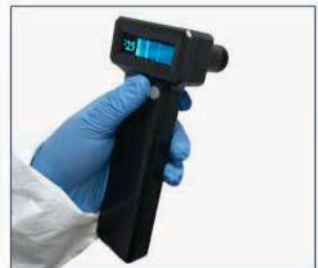
Single Hand Operation