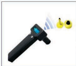
Built-in Ear Tag Reader